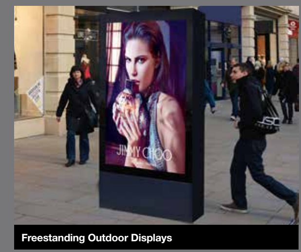
Freestanding Outdoor Displays

Following Ferrograph's 40+ year experience in the design and manufacture of exterior digital displays for public transport environments and the subsequent successful roll out of digital outdoor advertising displays at locations throughout the World over the last 10+ years, Ferrograph has continuously innovated its digital display range to ensure optimum performance and reliability.