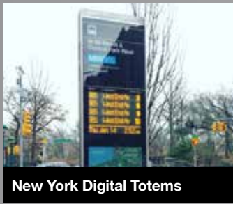
New York Digital Totems