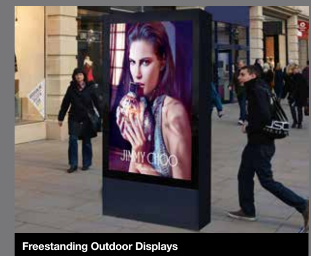
Freestanding Outdoor Displays

Following Ferrograph's 40+ year experience in the design and manufacture of exterior digital displays for public transport environments and the subsequent successful roll out of digital outdoor advertising displays at locations throughout the World over the last 10+ years, Ferrograph has continuously innovated its digital display range to ensure optimum performance and reliability.