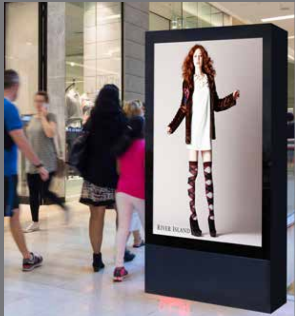
Freestanding Indoor Displays

Available in both 75" and 86" TFT display sizes, the Fuzion D6 range provides near full 6 sheet display size visibility.