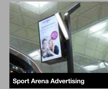
Sport Arena Advertising