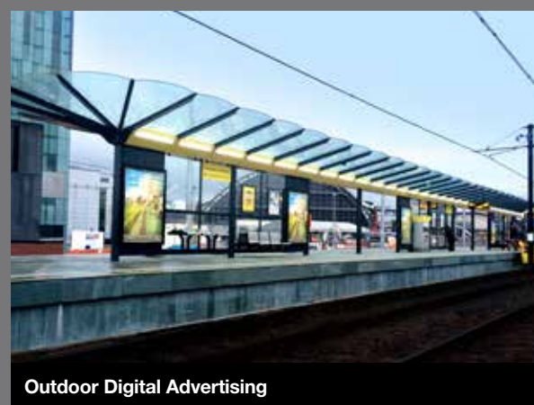
Outdoor Digital Advertising

Working closely with public transport authorities, outdoor advertisers, retailers and the DOOH market, Ferrograph are able to provide proven, cost effective solutions for both single and double sided digital displays in a range of attractive enclosures, for a multitude of industry sectors and applications.