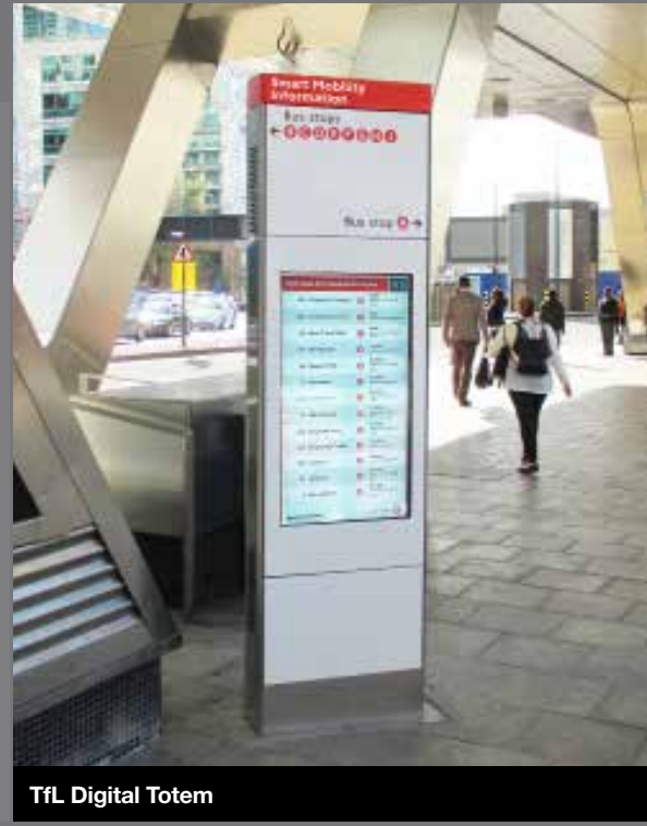
TFL Digital Totem